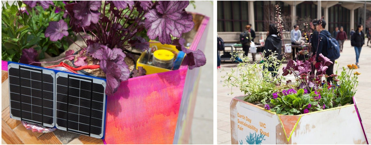
Jared Kelley-Hudgins (BA '18), Atmospheric Orchestra installation at UIC Earth Day Sustainability Fair, 2018